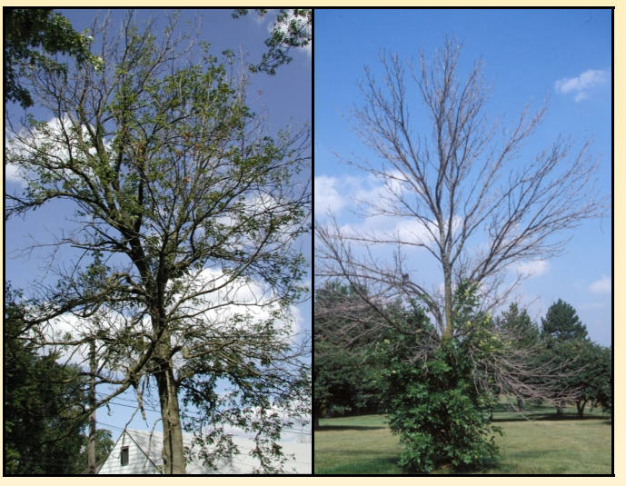
Ash trees near death due to EAB